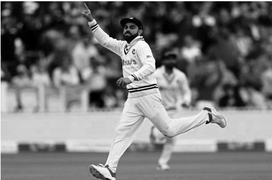
Even the aggression Virat Kohli wears on his sleeve is supposed to emanate from the BCCI’s might

that was a depleted Australian side missing Steve Smith and David Warner and still recovering from a bruising ball-tampering scandal. This time, India was the depleted team, missing its regular captain, who was away attending to his parental duties, and a bevy of other players because of injury. Before 2018-19, no other Indian team had won a Test series in Australia: not with the great Sunil Gavaskar and Kapil Dev, not with Sachin Tendulkar and Rahul Dravid playing under Ganguly, not even when Bishan Singh Bedi led a strong team against Bob Simpson’s side ravaged by the Packer rebel series in 1978. Ironically, the recent surge of Indian cricket can be credited in large part to the IPL, the very altar at which cricket was to be sacrificed. T20, as the old British saying goes, was just not cricket. It was a hit and giggle machine merely meant to maximise revenues, a show in which the space on players’ leading arms could be sold to advertisers separately from